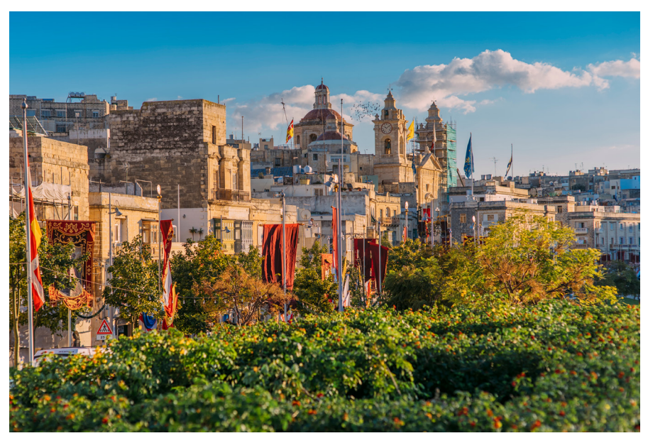
The Three Cities

After breakfast, check-out. Transfer to the airport for your flight back home. (B)