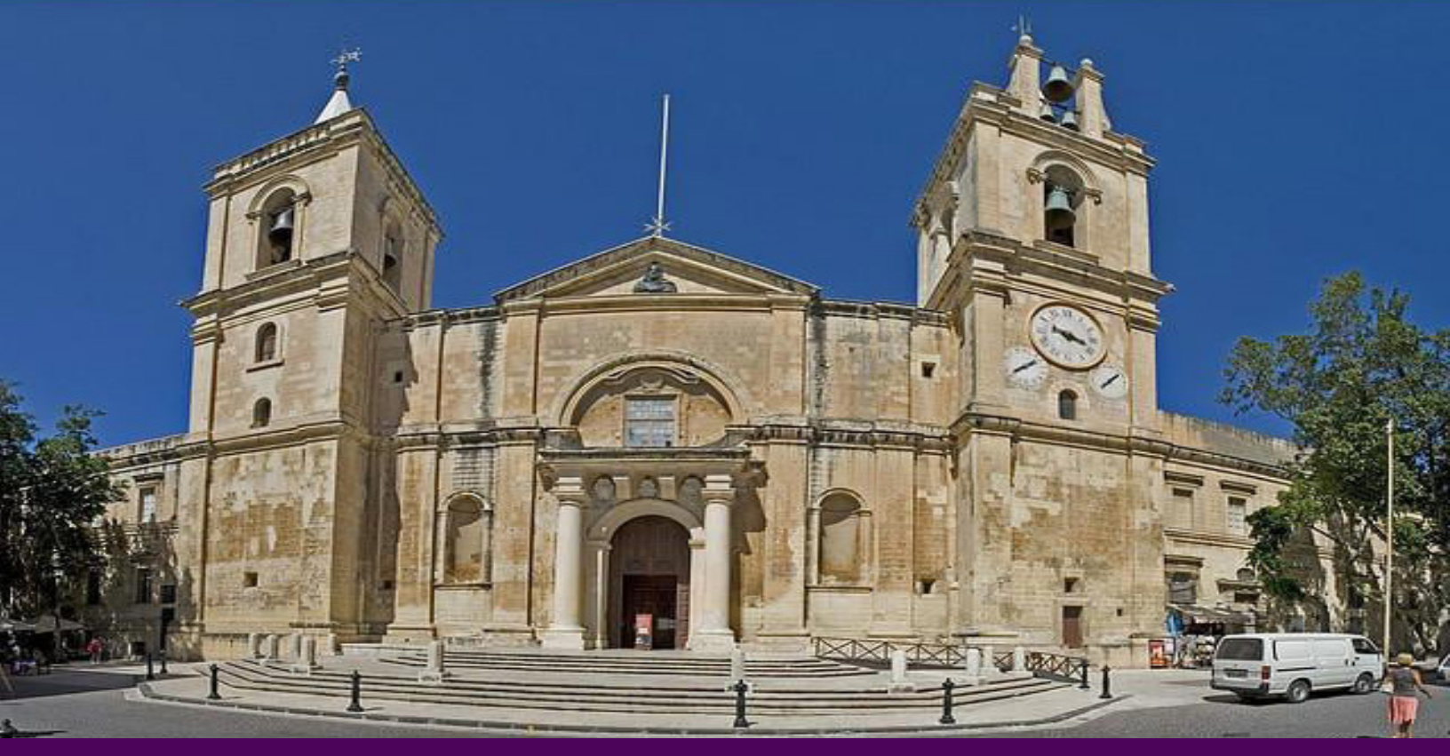
St. John's Co-Cathedral