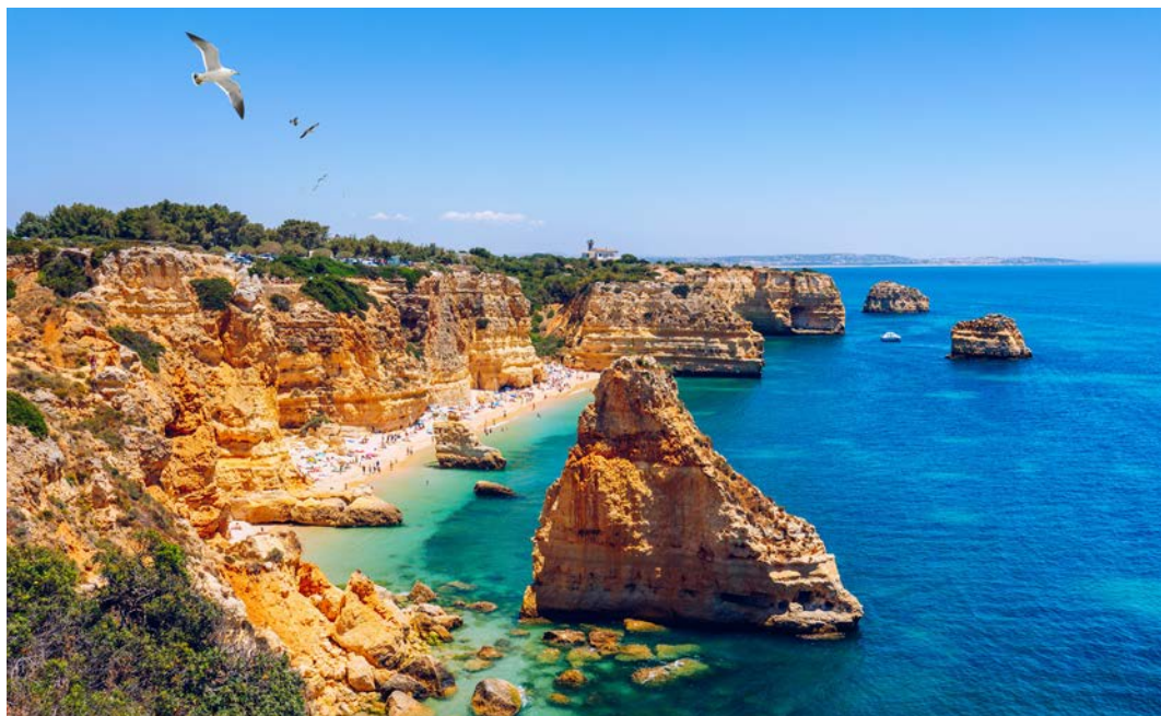
Praia da Marinha

Day 4: Albufeira - Faro Breakfast at the hotel. Private transfer to the Faro Airport. (B)