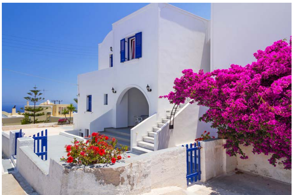
Fira town in Santorini Island

DAY 15: Departure. Transfer to airport for the flight back home.