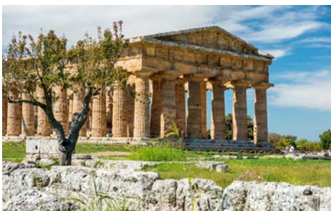
Temple of Poseidon

DAY 2: Morning free. Noon visit of a local winery including wine tasting & snacks. Continue to Sounion. Visit the Temple of Poseidon. Dinner at local seaside restaurant. Overnight in Athens. (WT, D)