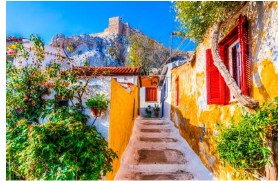
Plaka District street view in Athens