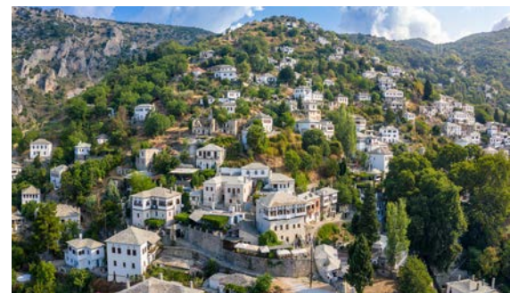
Makrinitza on Pelion mountain

DAY 6: Departure and transfer to Kalambaka. Afternoon transfer to Aspropotamos. We shall visit “Pyrgos Mantania” for a brief presentation and introduction to the local mushrooms variety, collection and use in cooking, dinner will follow with local recipes. Overnight in Kalambaka. (D)