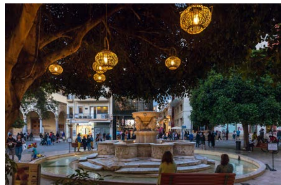
Lions Square, Heraklion