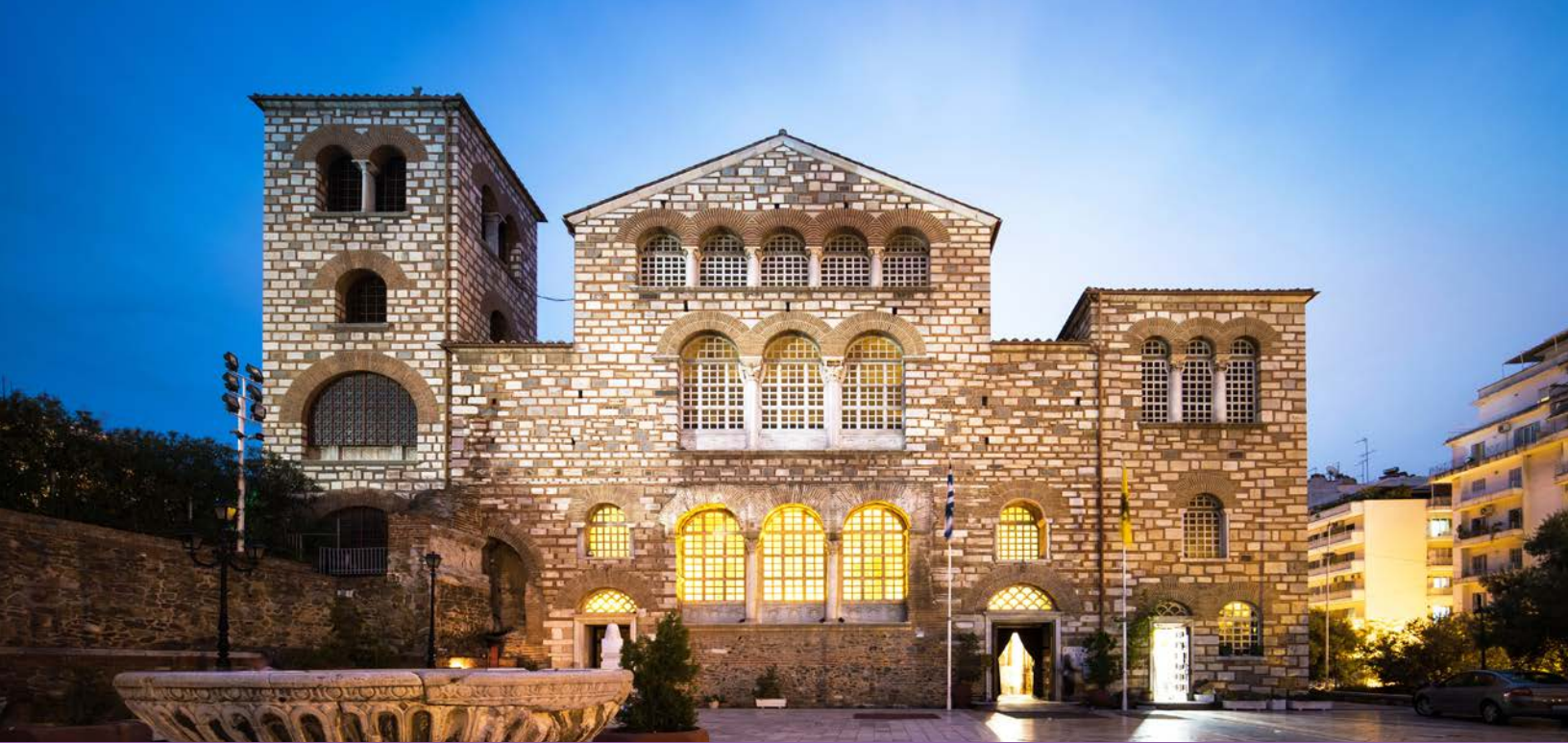
Saint Demetrius Basilica in Thessaloniki, Greece