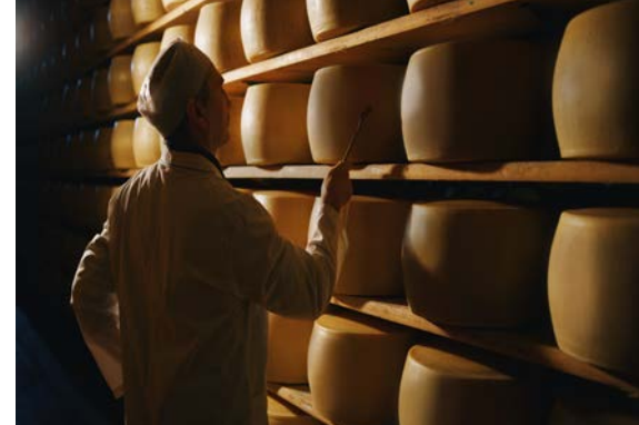
Italian Cheese Maker a chalky cliff in the valley of the river Platani, lies Sutera, a small agricultural borgo inhabited by about 1500 people. The town of medieval origins is inserted in an area of great interest and appeal. Sutera and its territory was inhabited since prehistoric times by indigenous peoples, as reflected in the many caves scattered throughout the territory and its history is closely linked with that of Greeks, Romans, Byzantines, until Muslims and Normans, who left here important evidences of their passage. The small borgo, with its houses piled one upon the other, in the middle of a maze of narrow streets in lava and limestone. it has maintained its medieval structure. The oldest part of the town is the district of Rabato, reminiscences of ancient Arabian, a characteristic extricate of narrow winding cobbled streets, overlooked by the houses in chalk. (B, D, CT)

Onward to Sutera, the balcony of Sicily. On the slopes of Mount San Paolino,