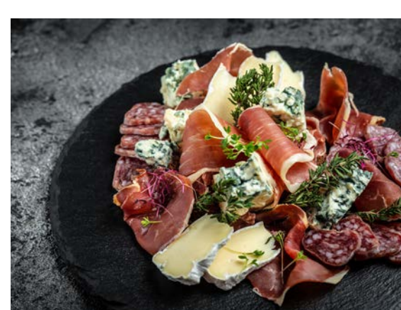
Aperitif di Italia