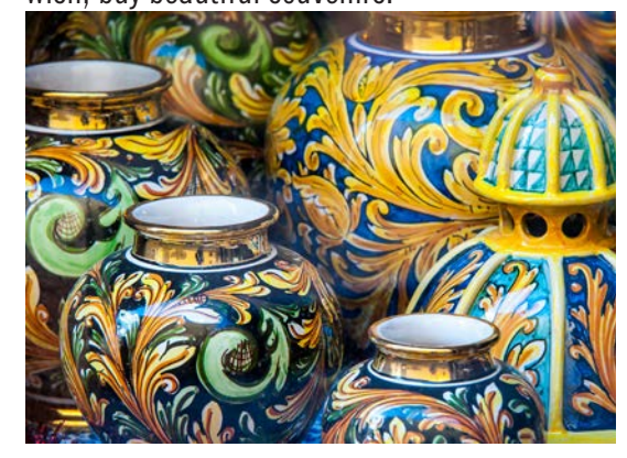
Colored ceramic vases from Caltagirone

products. Pistachio creams, cheese, nougat, marzipan, cold cuts, chocolates from Modica, organic almonds, extra virgin organic olive oil, almonds wine and wine liquor Zibibbo are just some of the delicacies you will taste. In addition to the culinary tradition you will appreciate typical art pottery of Sicily and if you wish, buy beautiful souvenirs.