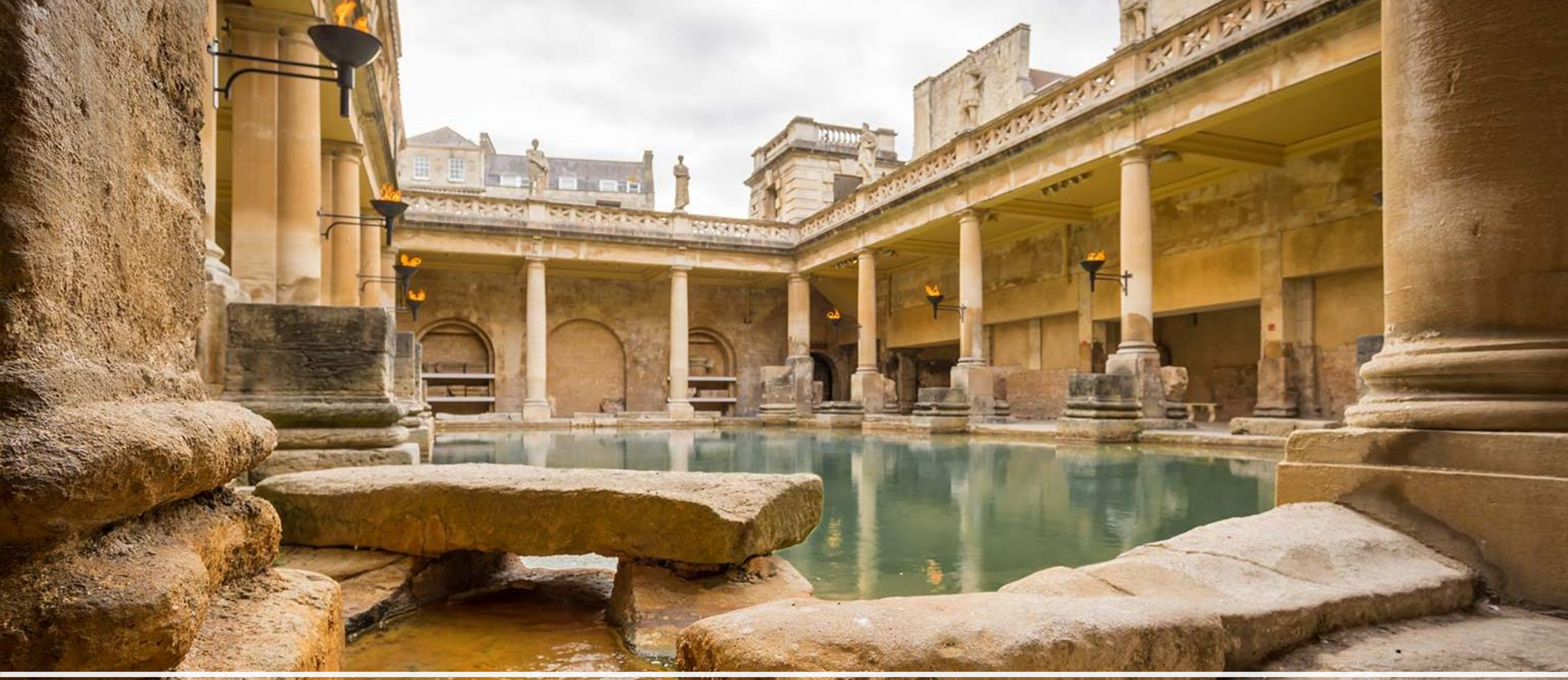
Roman Bath Video