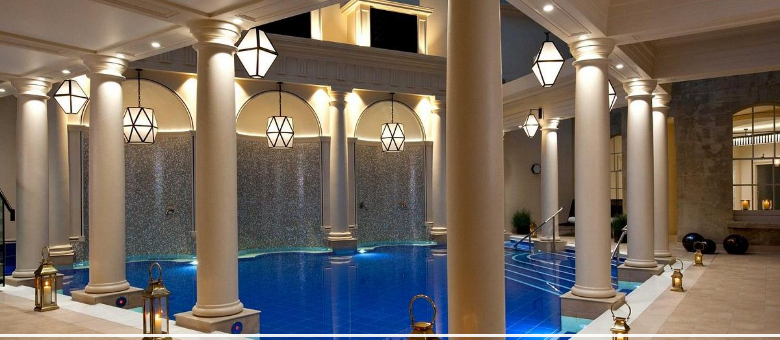
Gainsborough Bath Spa Hotel Video