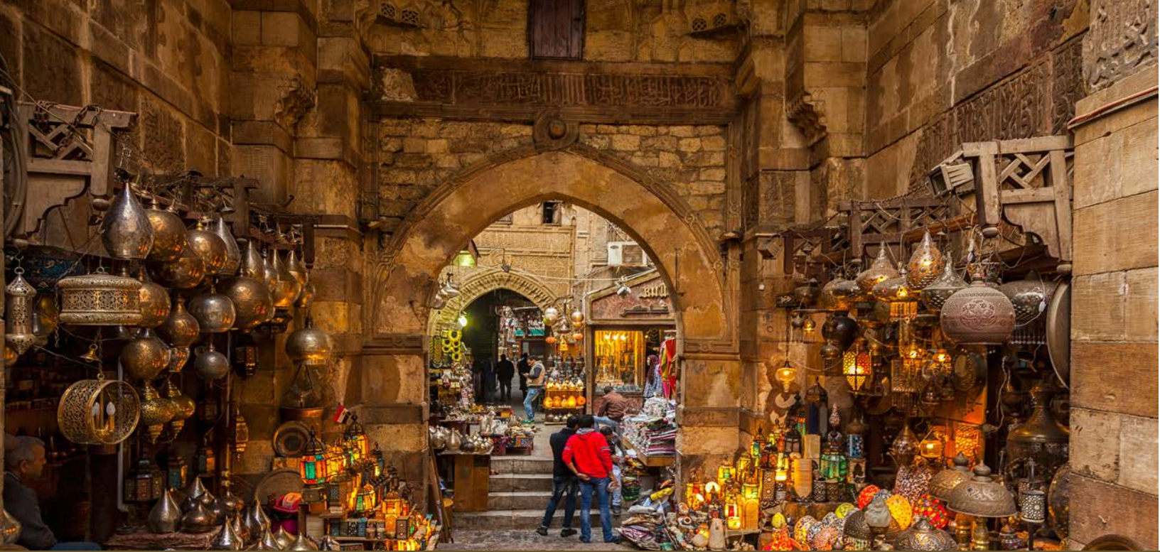
Khan El Khalili Bazaar, Cairo