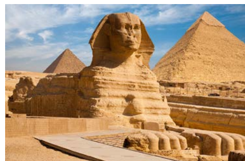
The Great Sphinx