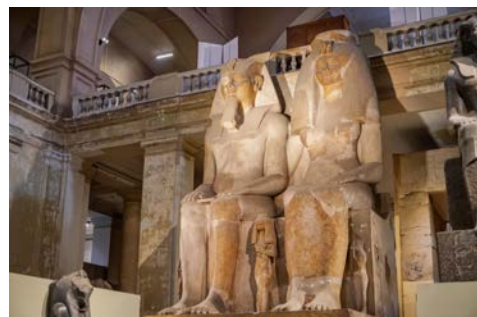
Amenhotep III and Queen Tiye, Cairo Museum