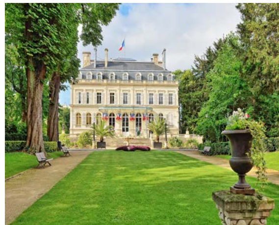
City Hall in Historical Center of Epernay