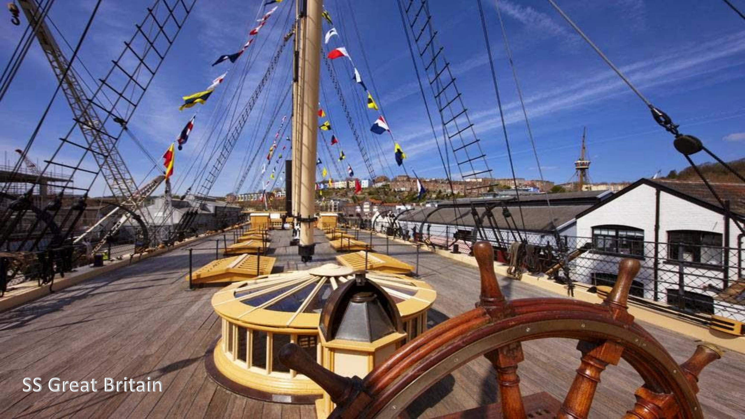
SS Great Britain