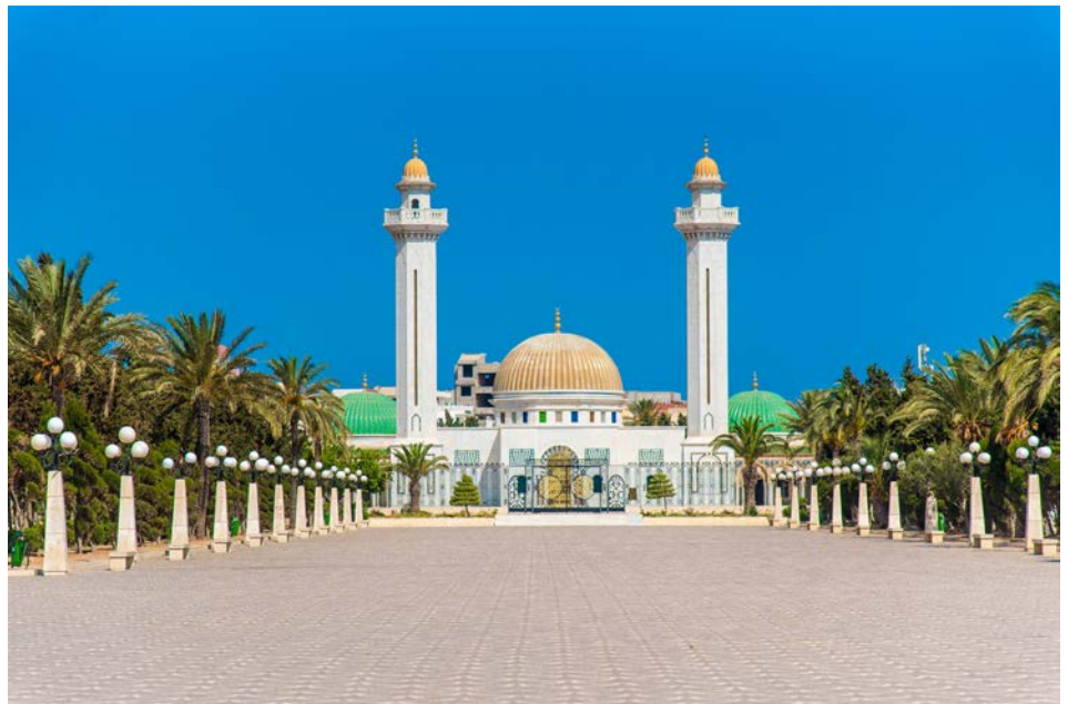
Mausoleum of Habib Bourgiba

After breakfast, departure to visit Monastir and the Ribat, continuation to Mahdia. Visit of the cemetery, continuation to El Djem and visit of the amphitheater. Return to Sousse. Diner and over