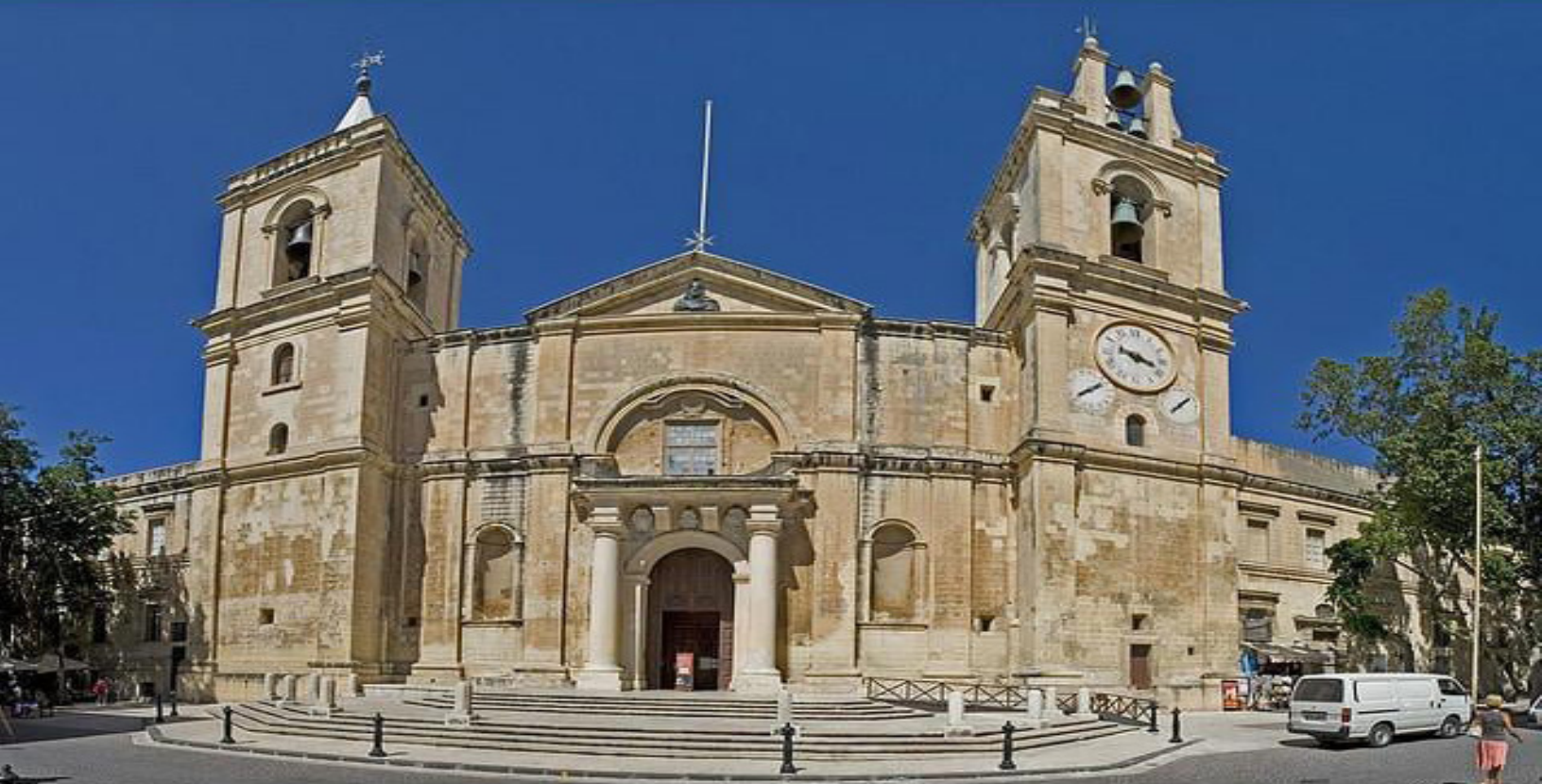
St. John's Co-Cathedral