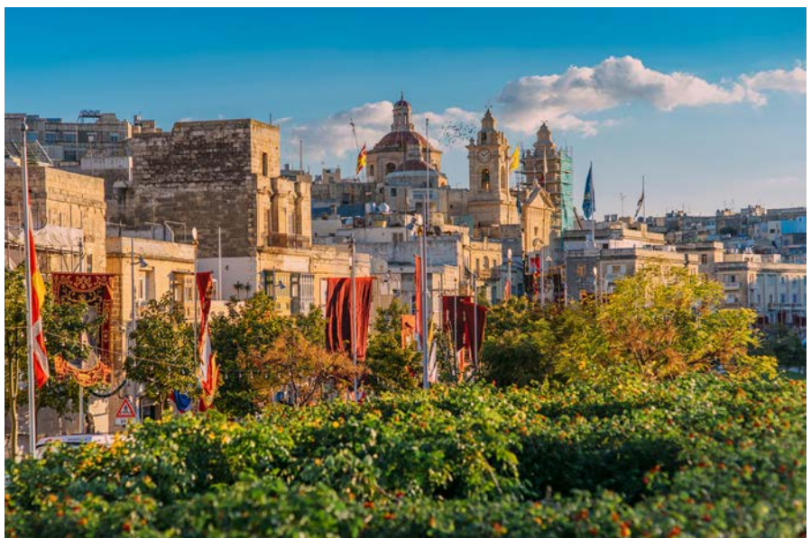
The Three Cities

Day 6: Departure After breakfast, check-out. Transfer to the airport for your flight back home. (B)