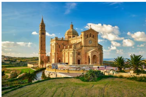
The Basilica of the National Shrine of the Blessed Virgin of Ta' Pinu in Gozo

waterfront we take a typical harbor boat (dghajsa) for a tour of the colorful harbor creeks. From the Senglea Garden, situated at the tip of the peninsula, enjoy a stunning 360° view of the Grand Harbour, including the impressive Fort Sant Angelo from where Grand Master La Valette led the defense of the island during the Great Siege of 1565. Lunch will be at local typical restaurant. Return to the hotel and dinner at local restaurant. (B, L, D)